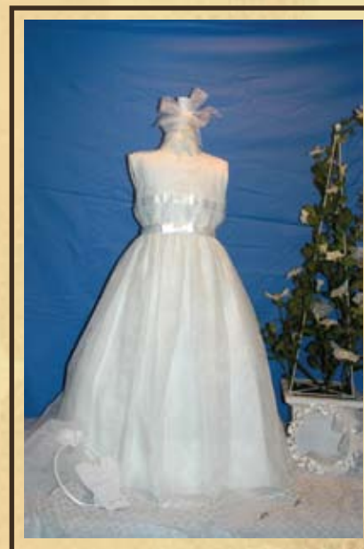
Beautiful First Communion dress with handmade dotted sheer overlay and satin bow detail. First Communion veils and head pieces with white gloves and sheer bows. Pearl rosary with silver cross and chalice.