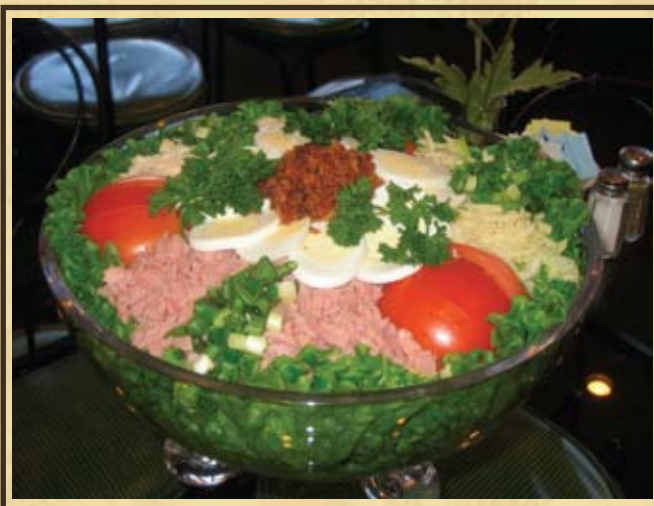
Our famous Woman's Exchange salad, artfully arranged for you in the bowl of your choice.

A full tearoom menu is also available for carryout (one is enclosed in this newsletter), and orders may be phoned in advance. This menu is perfect for providing office lunches or early dinners. Call ahead to reserve orders. Selections may change daily, and often sell fast. Our newly featured dinner entrée is Chicken Florentine Alfredo. Homemade soups, chicken salad, tuna salad, egg salad, and our famous Woman's Exchange salad dressing are also available by the pint and quart.