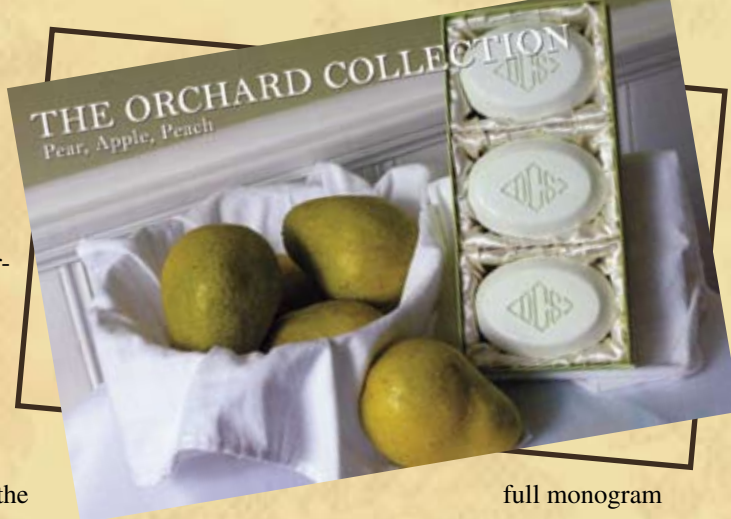
full monogram able in four color and fragrance

The Woman's Exchange offers personalized gifts including monogrammed soaps and candles. Soaps are available in 12 color and fragrance combinations, and are packaged three per box. A box of three soaps personalized with a single initial retails at $28.00 while the retails at $36.00. Please allow a two-week lead-time. Candles are available in four color and fragrance combinations, are sold individually, and are available for special order. Several tableware items are also available with personalized monogram including acrylic tumblers, mugs, and hand-painted glass stemware. For pet lovers, the Exchange offers pillows, framed prints, and more available in a variety of cat and dog breeds. If your pet breed is not in stock, most are available to special order.