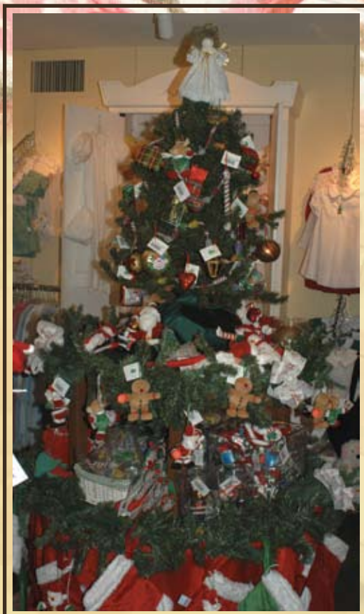
There are stocking stuffers galore at the Exchange!